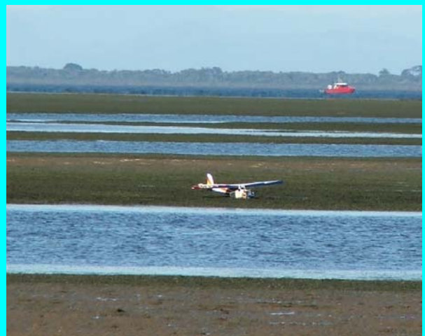
Well Graeme - caught any fish yet ?