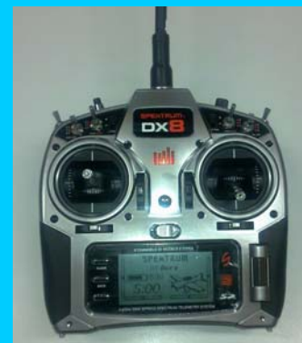
Spektrum's new dx8 radio with telemetry.

Last but not least, Keith managed to pull off about 5 winners in the raffle.