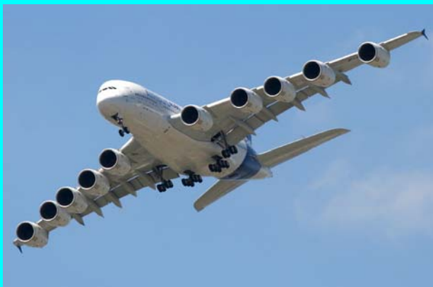
The answer to Qantas's woes. One 380 with the lot please.