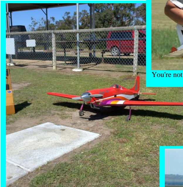
One nice piece of work in front of another. Great pads guys.