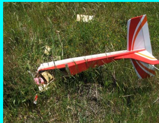
Wing foldup syndrome