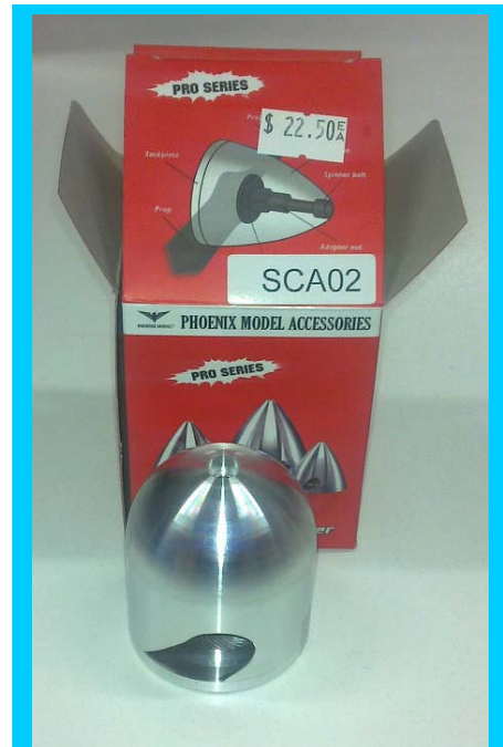
Pheonix's new spinner.