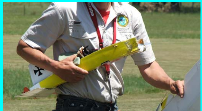
You're not called Crash Bandicoot for nothin eh boss ?