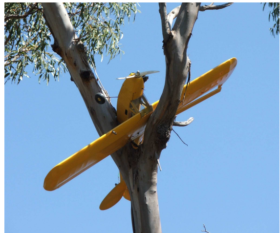
Great Landing Greg