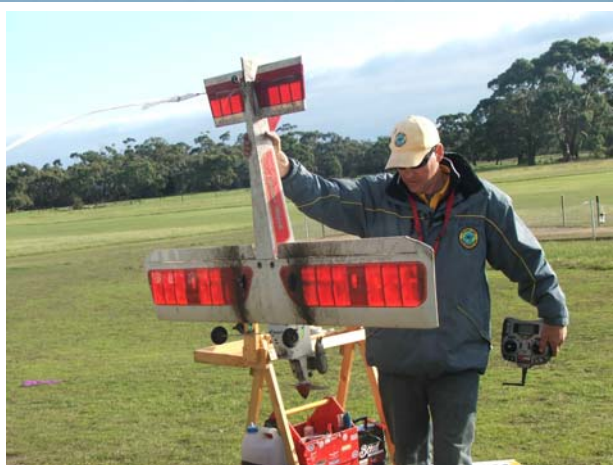
Bonus free mudspray, for all flyers this month only...