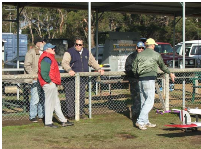
Nothing like a good chinwag to stop the jaws from freezing up