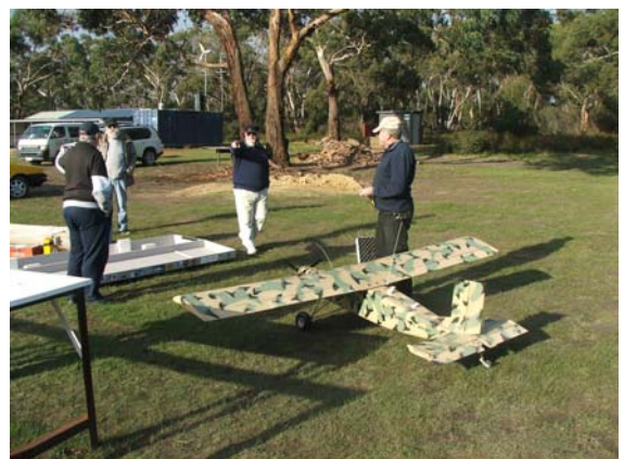
Nice to have a visit from the Porter again