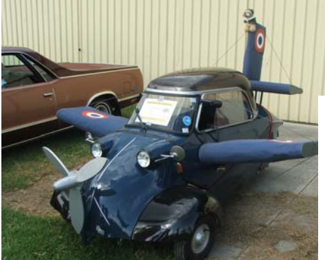
Maybe this one was feeling a bit left out ?

Check out the level of detail in this model under construction