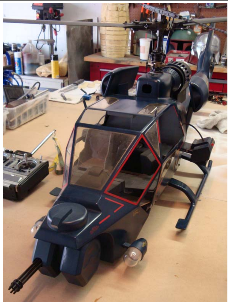
One of the original Blue Thunder models.

The model Gazelle used, was actually a 1/6 scale Hirobo kit, sold in the days before ARF became an abbreviation. The Gazelle kit includes the full 6 blade shaft driven fenestron fan at the tail, quite a different mechanism (compared to today's) for mixing collective and pitch / roll actuators - actually a separate unit that huddles up next to the base of the main shaft. As a result, the rotor head mechanics look overly simple from the outside. Hirobo took this flatbed mechanics design and sold it with at least six different body / tail combinations as a JetRanger, Tow Cobra, Lama, Enstrom, Iroquois as well as the Gazelle. Other specs include wooden main blade diameter of 1.58m. Engine is 60 size aircraft, NOT a Helicopter motor. Weight 5.2kg. Fuselage approx 1.4m.