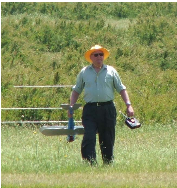
Now.. Which way back to the club house ?