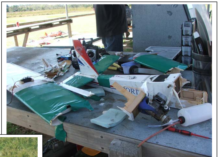
Another Classic bites the dust

XMAS BBQ pickys - Sorry, don't have any. Anyone ??