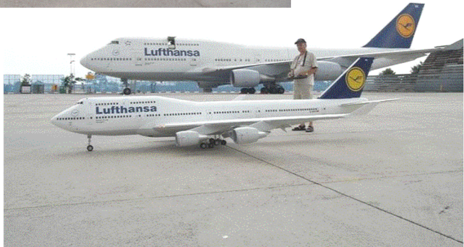
Scale Boeing 747 in lufthansa livery