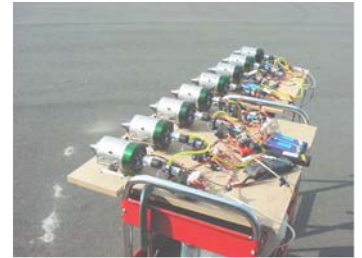
Boeing B52 Stratofortress, powered by 8 gas turbines.