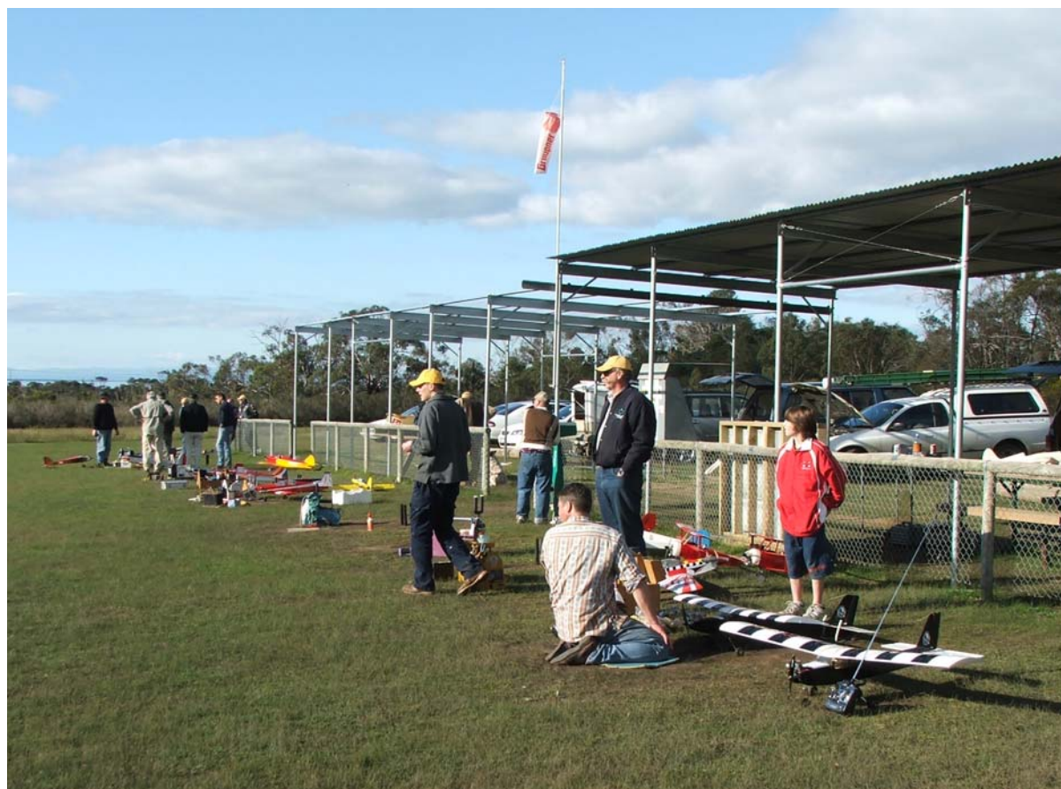
One Sunday in Sept 2007.