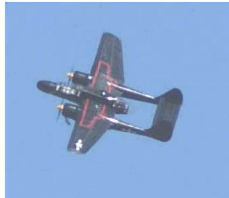
The ARF Scale winners. P61 (above) and Cub (below).

More info on Spads, check out http://en.wikipedia.org/wiki/Simple_Plastic_Airplane_Design