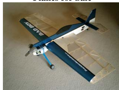
"Bad Boy" and the "Rocket"